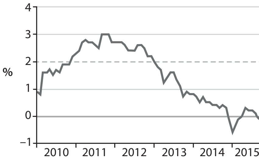
Figure 1 Eurozone CPI rate of inflation, 2010 to 2015